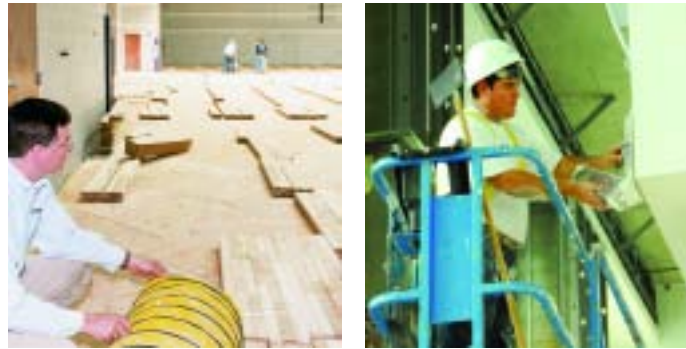
Using Munters dehumidifiers to dry work environments allows construction work to be completed faster. Painting and drywall finishing can be done quickly, sometimes allowing "mud" to be sanded the same day it is applied.

In humid conditions, wood flooring and fine finishes can absorb moisture directly from the air causing warping, cupping and expansion. These factors play havoc with installations. After the building heat is turned on and winter comes, finishes and floor boards will contract as moisture is given off, creating spaces and cracks unacceptable to the customer. Working in humidity free environments with "stabilized" wood materials makes installations accurate and prevents moisture problems from arising later.