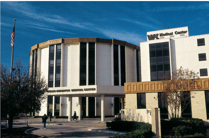
At the Willis Knighton hospital, a Munters MDAire system allows eight Surgeons to simultaneously set different OR's to the exact temperature and humidity needed for each procedure.

Consequently, Purtle & Associates chose a Munters MDAire System, which uses desiccant technology to control humidity at low temperatures.