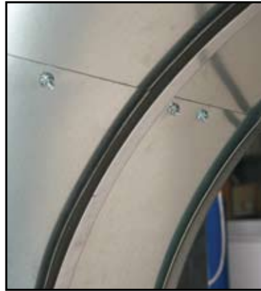
Rugged Door Seal

Weather tight seals for energy savings. Outer edge of doors close tight against a rugged bulb seal, not a cheap foam gasket. The hinge area between doors is sealed, unlike typical butterfly dampers.