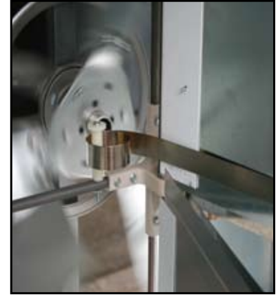
Unique Door Spring

Unique constant force stainless steel springs allow doors to open fully when the fan is on and close consistently when the fan is off.